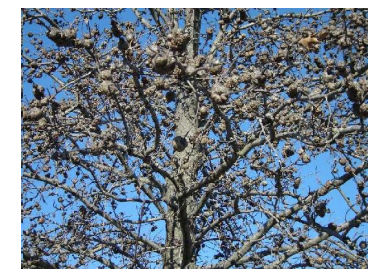
Twig galls can be damaging